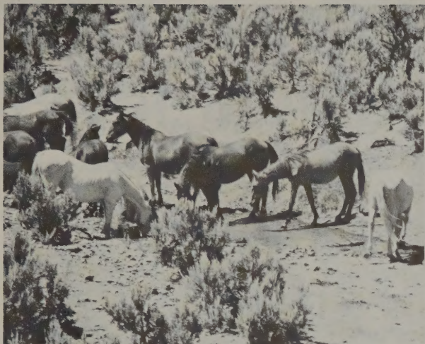
Congress has told the Bureau of Land Management to remove more than 17,000 excess wild horses and burros from the public rangelands during this fiscal year.

and free on the open range held ever increasing fascination.